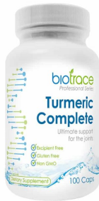
BioTrace Turmeric Complete