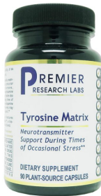
PRL Tyrosine Matrix