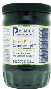
PRL Colostrum IgG Powder