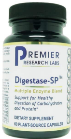
PRL Digestase SP