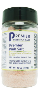
PRL Pink Salt