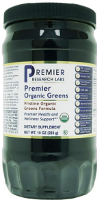
PRL Organic Greens