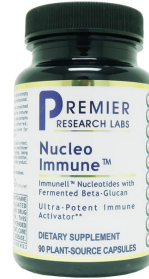
PRL Nucleo Immune