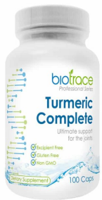
BioTrace Turmeric Complete