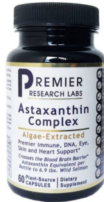
PRL Astaxanthin Complex