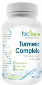
BioTrace Turmeric Complete