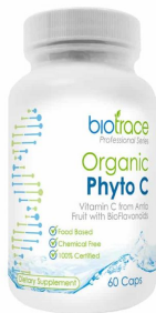
BioTrace Organic Phyto C