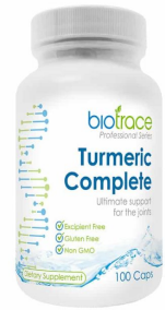
BioTrace Turmeric Complete