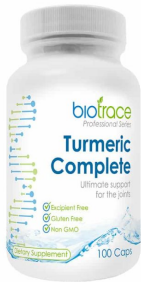
BioTrace Turmeric Complete