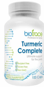
BioTrace Turmeric Complete