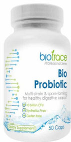
BioTrace Bio Probiotic