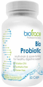
BioTrace Bio Probiotic (Best Before 07/2024)