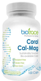
BioTrace Coral Cal Mag