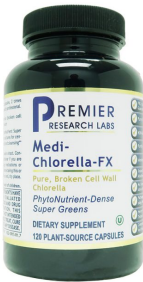
PRL Medi Chlorella-FX