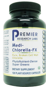
PRL Medi Chlorella-FX