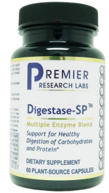
PRL Digestase SP