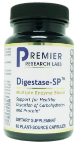
PRL Digestase SP