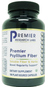
PRL Psyllium Fiber