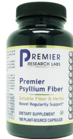
PRL Psyllium Fiber