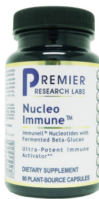
PRL Nucleo Immune