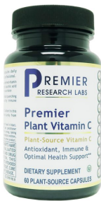
PRL Plant Vitamin C