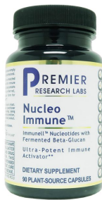
PRL Nucleo Immune