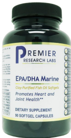
PRL EPA/DHA Marine