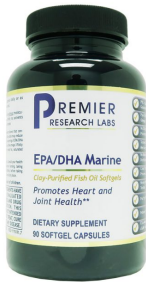
PRL EPA/DHA Marine