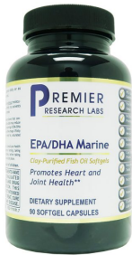
PRL EPA/DHA Marine