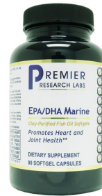
PRL EPA/DHA Marine