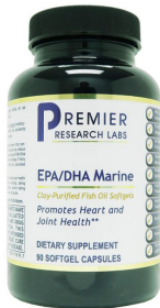
PRL EPA/DHA Marine