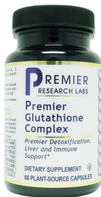
PRL Glutathione Complex