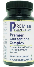
PRL Glutathione Complex