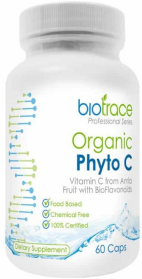
BioTrace Organic Phyto C