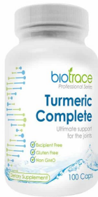
BioTrace Turmeric Complete