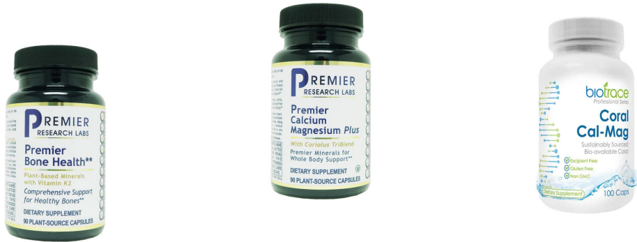
PRL Bone Health