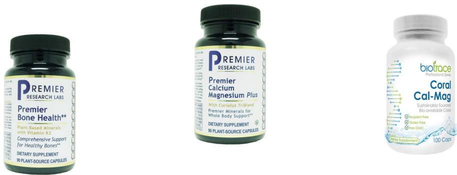
PRL Bone Health