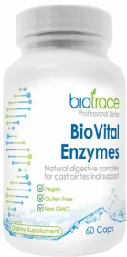
BioTrace BioVital Enzymes