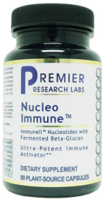
PRL Nucleo Immune