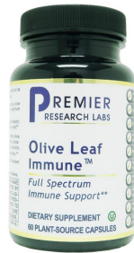
PRL Olive Leaf Immune