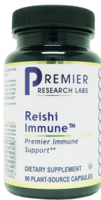
PRL Reishi Immune