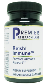
PRL Reishi Immune