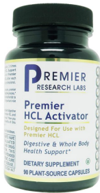
PRL HCL Activator