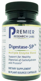
PRL Digestase SP