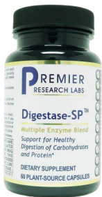
PRL Digestase SP