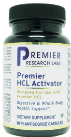
PRL HCL Activator