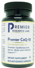
PRL CoQ 10