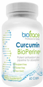
BioTrace Curcumin BioPerine