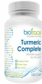
BioTrace Turmeric Complete