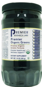
PRL Organic Greens