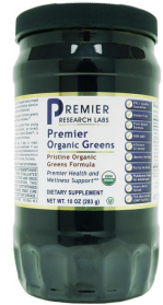
PRL Organic Greens