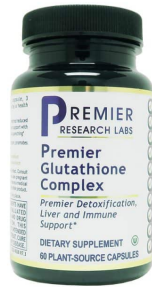
PRL Glutathione Complex