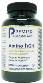
PRL Amino hGH