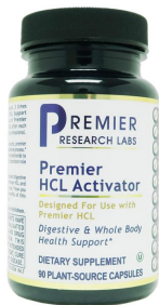
PRL HCL Activator