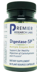
PRL Digestase SP