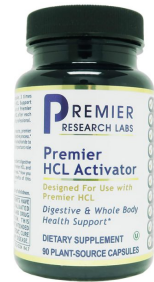
PRL HCL Activator