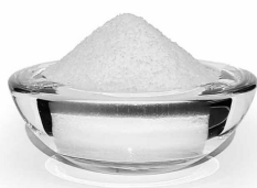
BioTrace L-Malic Acid