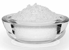
BioTrace Epsom Salt