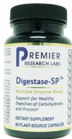
PRL Digestase SP