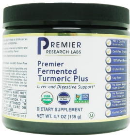
PRL Fermented Turmeric Plus