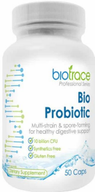
BioTrace Bio Probiotic