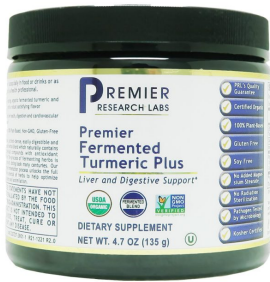
PRL Fermented Turmeric Plus