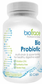
BioTrace Bio Probiotic (Best Before 07/2024)