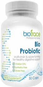
BioTrace Bio Probiotic