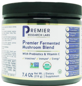
PRL Fermented Mushroom Blend