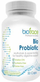
BioTrace Bio Probiotic