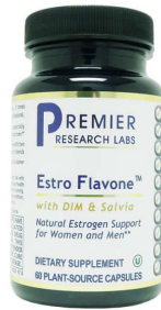
PRL Estro Flavone