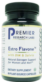
PRL Estro Flavone