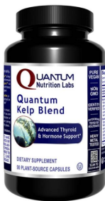
QNL Kelp Blend